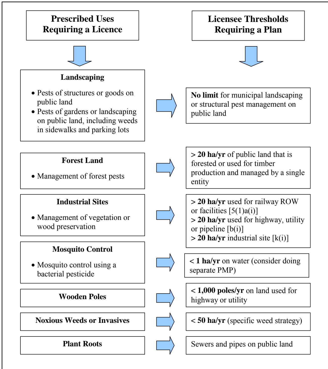
Figure 2. Prescribed Uses and Thresholds for Licences and PMPs.

documented. Record keeping and reporting are addressed in greater detail in Section 2 of this report. Figure 2 presents the prescribed uses for a licence.