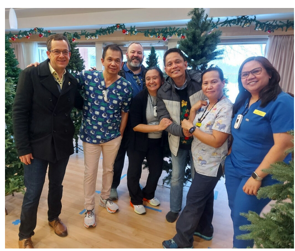
Mayor and Council and had a blast at the Reindeer Hunt at Rotary Manor - a great opportunity to connect with staff and residents. Lots of laughter was had by all and we're happy to report that everyone came out of the "hunt" unscathed!

Nearly all of our local physicians and many other healthcare professionals came together to celebrate those that are making a real difference in our community. Thank you to all our medical workers for your hard work and dedication - we appreciate you!