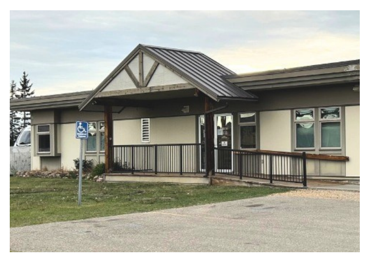
The Eljen Medical Clinic, located at 1300 111th Avenue in Dawson Creek