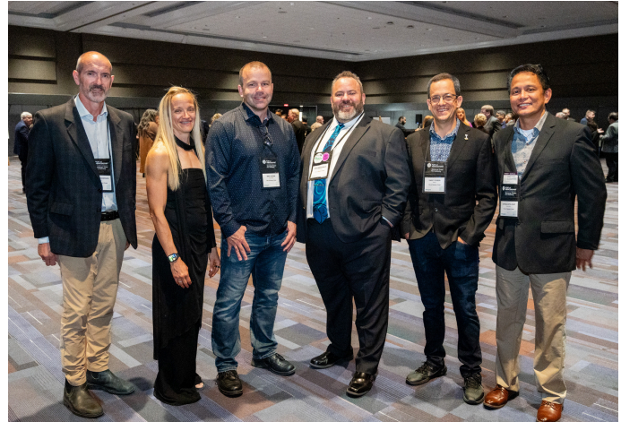
Mayor, Councillors and the CAO at the UBCM convention in Vancouver.